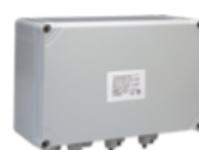
Power supply Unit 9.3389.10.000

For the power supply of wind speed transmitters, wind direction transmitters or combined instruments.