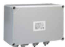
Power supply Unit 9.3389.10.010

For the power supply of wind speed transmitters, wind direction transmitters or combined instruments.