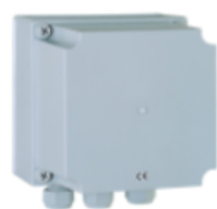
Power Supply Unit 9.3388.00.000